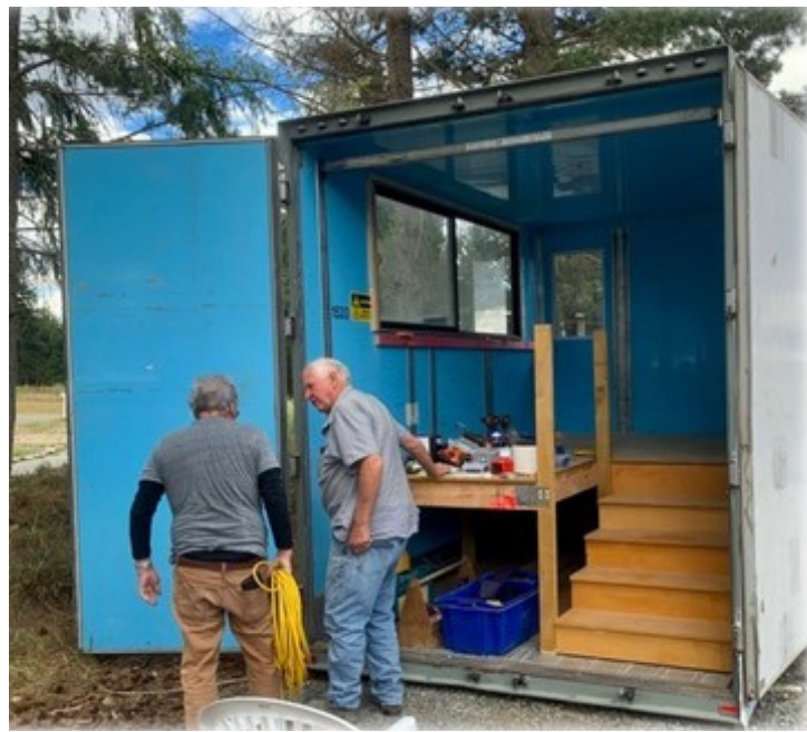
Volunteers installing the raised floor and stairs inside the hut

Finally the hut at the 1000m mark has provided service for 40 years but exposure to the elements have taken its toll.