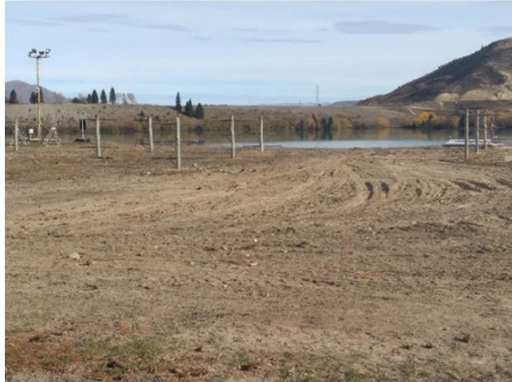
A view of the boat park after the tree removal

South Island Rowing are looking forward to welcoming schools to Twizel for the 2024 NZ Secondary School Championships. Maadi is the largest regatta that South Island Rowing host and considerable work has been undertaken to ready the course for the 2024 event.