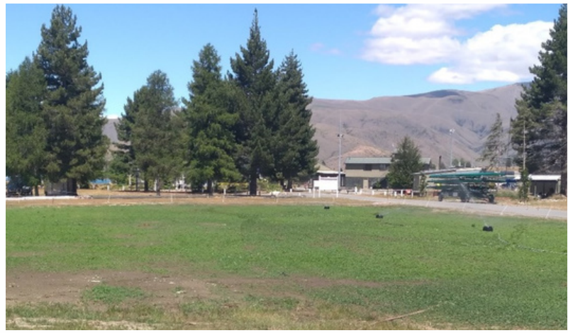
View of the trailer park showing the area that has been levelled