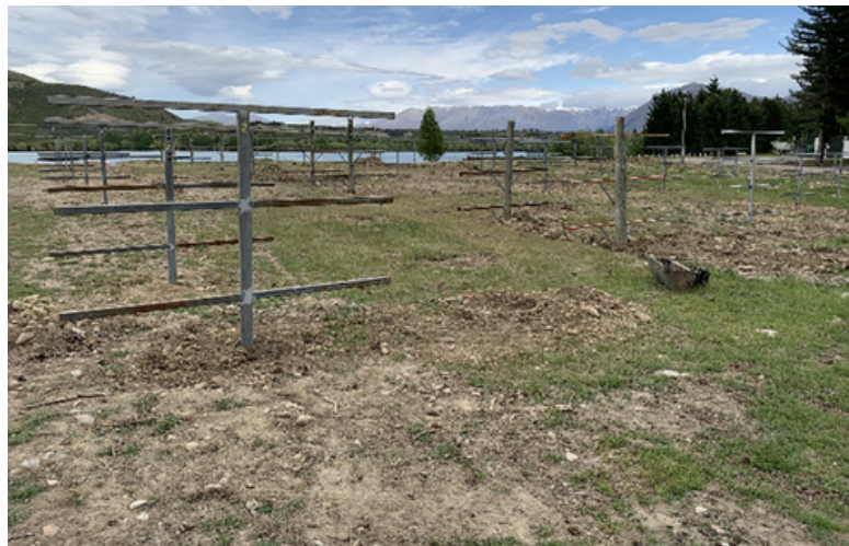
Racks realigned at the west end of the boat park

It is hoped that the majority of the new racks will be installed before the regatta but it will be a 2 year project.