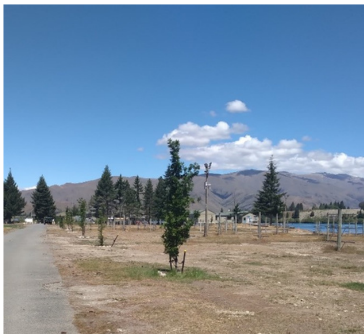
Trees on the road side of the boat park

Other projects include levelling of the trailer park just inside the gate. There was a considerable depression which sometimes flooded.